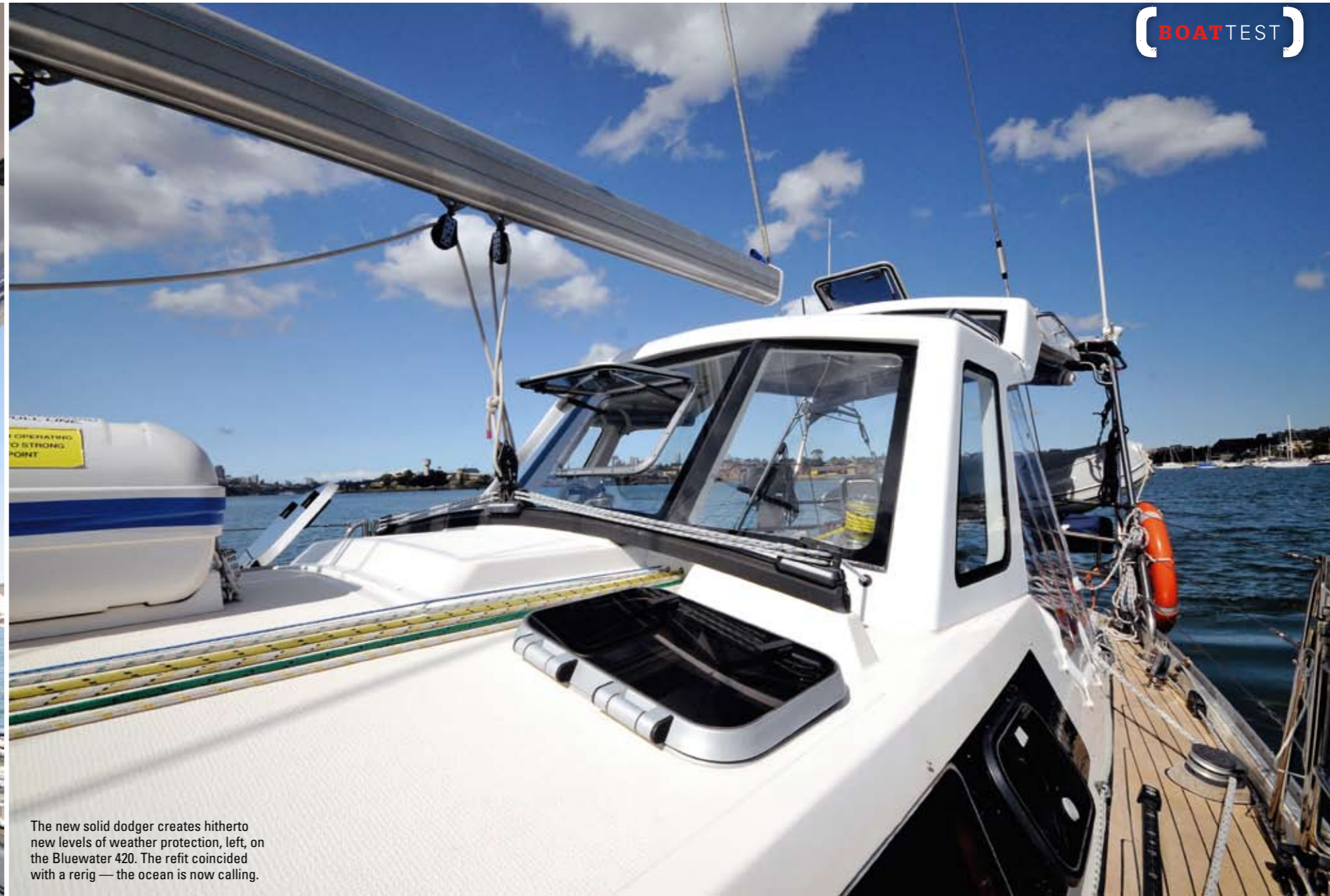
The new solid dodger creates hitherto new levels of weather protection, left, on the Bluewater 420. The refit coincided with a rerig — the ocean is now calling.

T he Australian-designed and built Bluewater 420 Raised Saloon yacht is a cruising icon that has easily stood the test of time. It's still the most popular Bluewater model and three are in build as this article goes to press.